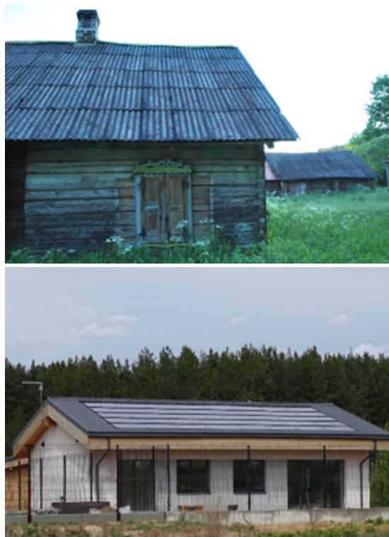
Figure 1: (non-) Energy efficient buildings.

Copyright@ Kęstutis Valančius, This article is distributed under the terms of the Creative Commons Attribution 4.0 International License, which permits unrestricted use and redistribution provided that the original author and source are credited.