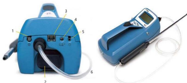
Figure 1. Particulate Meter P-Trak Ultrafine Particle Caunter 8525 (1 - On / Off button; 2 - Isopropyl alcohol cartridge; 3 - Data connector; 4 - Power connector; 5 - Headphone connector; 6 - Telescopic probe hose)

The particles concentration in the exhaust gas was determined using a P-Trak Ultrafine Particle Caunter 8525 particulate meter (Figure 1). The technical specifications of this device are given in Table1.