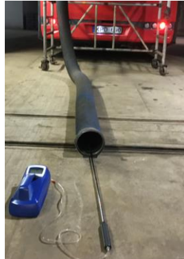
Figure 2. Particulate concentration measurement

In order to isolate the measuring medium from the ambient air, in which particles are also detected, and to ensure the most accurate possible values of the particles, the telescopic probe of the meter was inserted into the exhaust pipe extension (hose) and fixed in the same position as shown in Figure 2: