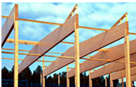
Figure 2. Alternative A_1 – double tapered glued laminated beams and columns

The first alternative structural system A_1 is composed of glued laminated timber, glued laminated columns and double tapered beams, as shown in Figure 2. Glued laminated columns are fixed rigidly to the foundations while glued laminated beams are flexibly supported on columns. Double tapered glued laminated beams form a slope which is necessary for water removal from roof. Glued laminated timber strength classes may be GL24, GL28, GL32, and GL36 according to standard EN 14080 (CEN, 2013). The straight axis elements may be glued up to 240 mm width, 2200 mm height and a maximum length may reach 40 meters.