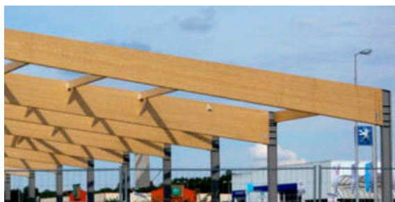
Figure 4. Alternative A_3 – single tapered glued laminated beam and I type steel column

The third alternative structural system A_3 is hybrid which consists of I type standard steel beams and tapered glued laminated beams, as shown in Figure 4. This structural system is a typical three hinge hybrid frame in which beams and columns are rigidly connected while the connection between beams is pinned. Columns are also supported to the foundation flexibly which results to easier and cheaper foundations, as bending moments are not transferred to the foundation.