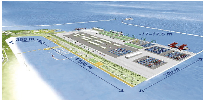
Fig. 1. The outer port of Klaipeda JICA experts vision

The Lithuanian government signed an agreement with the Japan International Cooperation Agency (JICA) for Klaipeda port development feasibility studies to come to some resolution regarding the development of Klaipeda Port. JICA experts conducted the study and presented options (Fig. 1) for construction of the outer port in Klaipeda (at Melnragė) [7, 8].