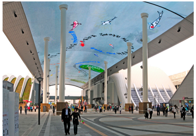
Fig. 6. The International Pavilion, Yeosu, 2012.

countries created their own architecture, which represented main attractions at the World Expo.