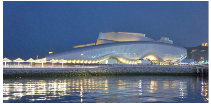
Fig. 5. Thematic Pavilion, Yeosu, 2012.

The building is composed of three layers: the ground floor contains various leisure activities, the roof emulates ocean waves by controlling its microclimate, and a multi-purpose tower forms the Archipelago shapes by determining the natural ventilation and light source. The visitors can, therefore, experience a topography of simultaneity, connecting interior and exterior, in which a street full of vital urban energy exists in the same space as a number of more unpredictable natural areas, all connected through the theatricality on the over-arching roof structure [10]. The roof structure is covered with media ceiling – a phenomenal scale screen, which reaches 218 m in length and 30 m in width (Figure 6). In the International Pavilion, all the participating countries had their own local pavilions, where