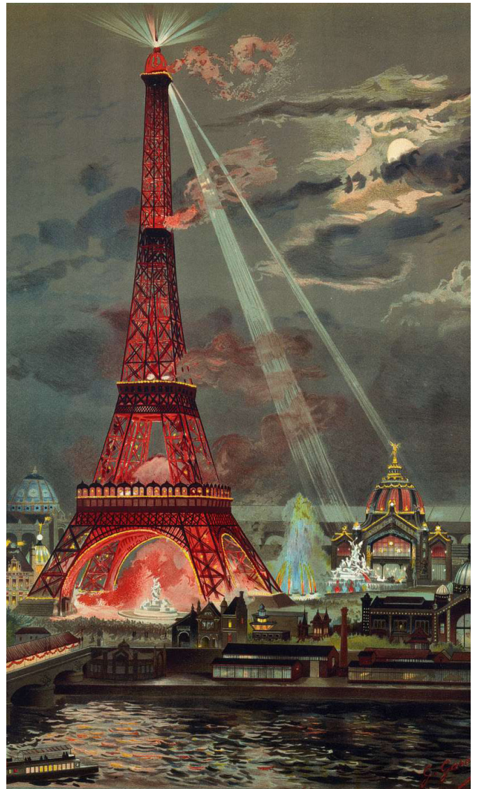
Fig. 2. The Eiffel Tower, Paris 1889.

As people have more and more entertainment options, world expositions have continued to find new ways to provide information and inspiration in new ways [5]. The following global tendency of architecture of world’s fairs is seen: people claim that television and the Internet have made world’s fairs obsolete — people have finally exhausted the potential to entertain, enlighten, and inspire outside their own home. Another global tendency of architecture is that building surfaces become media screens