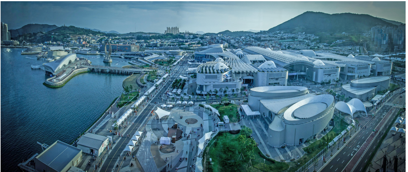
Fig. 4. Expo 2012 Yeosu.

and these screens are visually more significant than the form or shape of the building. The media content becomes increasingly important.