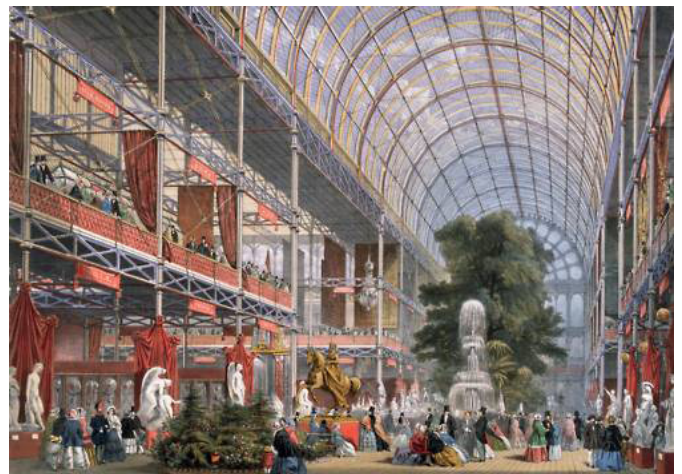
Fig. 1. The Crystal Palace, London 1851.

Paris took over and organized brilliant exhibitions in 1867, 1878, 1889 and 1900. Soon, other large centres were also eager to welcome craftsmen and manufacturers from all over the world; exhibitions held in Vienna, Amsterdam, Brussels, Barcelona, St. Louis, Turin and Philadelphia were among the most successful international exhibitions. World’s Fairs excited and inspired millions of people around the world by expressing the hopes and desires of their times. Perhaps unwittingly, they also provided a fascinating glimpse into the realities of those times. Although the expo architecture was represented by temporary buildings, some of them were actually genuinely iconic, which made a huge impact on the history of architecture. Because of the limited scope, this paper will recall a few constructions: the Crystal Palace (mentioned above), because it was the first expo pavilion, one vertical and one horizontal example: the Eiffel Tower, built for the Exposition Universelle in Paris, 1889 (Figure 2), and the legendary Barcelona Pavilion (also known as the German