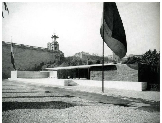
Fig. 3. Barcelona (German) Pavilion, Barcelona 1929.