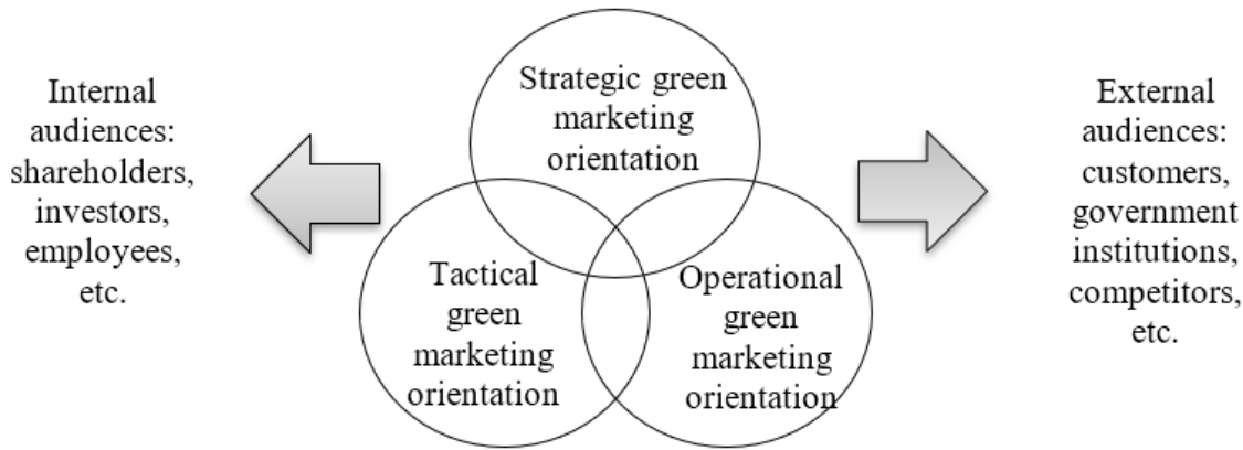
Fig. 2. Dimensions of green marketing

of green marketing (Mahamuni, Tambe, 2014; D'Souza et al. , 2015; Singh et al. , 2016; Ahmadzadeh et al. , 2017); others demonstrate multidimensional approaches to green marketing (Papadas et al. , 2017; Ranjan, Kushwaha, 2017; Parkman, Krause, 2018).