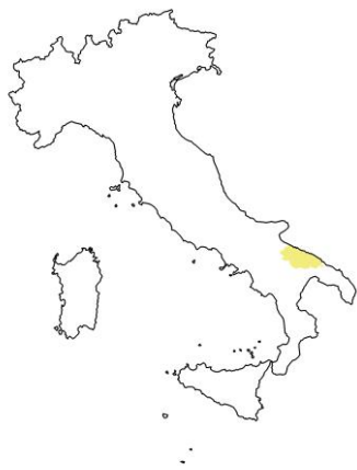
Figure 3.3. Italy, Bari region (Scheme by D. Traškinaitė 2020)

Within the space allotted to this topic, we would like to discuss a few examples of how local architecture is related to human wisdom as well as responding to issues of sustainability. These examples come from two different parts of Europe: southern and eastern.