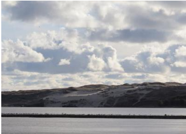
Figure 3.11. Landscape of Kuršių nerija.