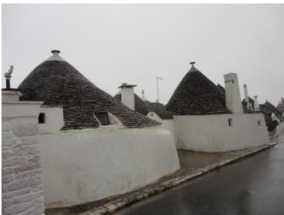
Figure 3.5. Traditional vernacular dwelling, Lithuania.

Trullo is a dwelling of a circular or square shape and has few openings, except a small aperture in the roof cone for ventilation.