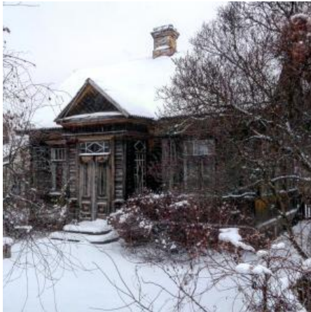
Figure 3.7. Vernacular dwelling in southern Lithuania.