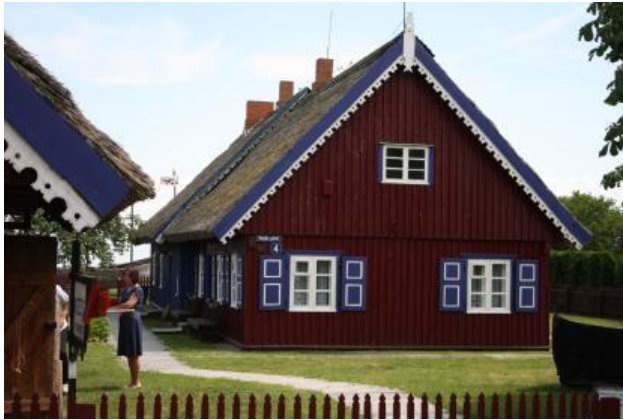
Figure 3.9. Traditional heritage dwelling in Kuršių nerija.