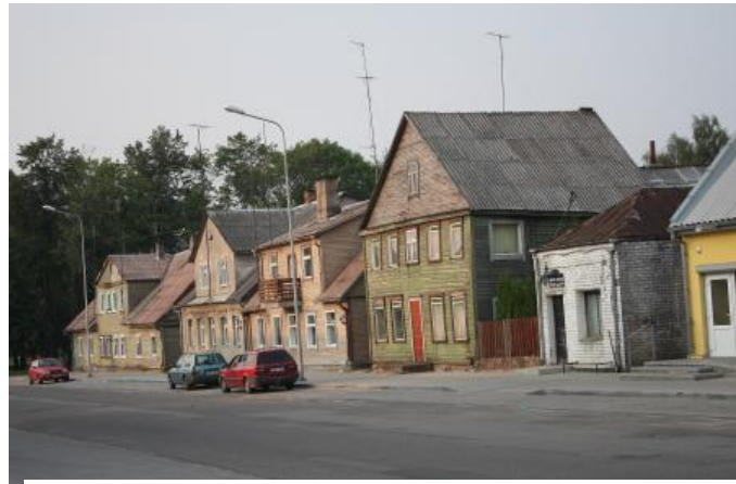
Figure 3.8. Vernacular dwellings in a Lithuanian town.

Climate in Lithuania is very different from Italy: It is much colder in winter, and local dwellings require heating throughout the winter. Thus Lithuanian rural houses were equipped with clay stoves, and wood was/is used to heat these dwellings during winter – which can be quite cold in eastern Europe, occasionally going down to some 10-20 degrees below zero (Celsius).