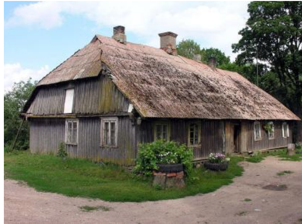
Figure 3.2. Traditional vernacular dwelling in northern Lithuania.

Despite a large period during which architectural Modernism and Post-Modernism dominated globally, certain parallel or even opposing trends have simultaneously emerged in architecture and city-making, and traditional architecture among them. The interest in traditional/vernacular building and settlements was triggered by various factors. At least two reasons for the current upsurge in traditional architecture and urbanism can be mentioned: 1) the growing importance of heritage and rising awareness of the cultural/aesthetic importance of architectural and urban legacy; 2) it is the requirements of sustainability and resilience that contributed to the expanding field of traditional architecture studies with a hope to demonstrate that human beings have attempted to establish a balance with their environment in various historical periods preceding modernity. It is often argued/demonstrated that certain sustainable ways of building have always existed in the history of humanity. Renown architect and architectural theorist Christopher Alexander has dedicated his efforts to prove that human civilization has developed a universal, timeless ‘language’ of architecture or the concept that he called ‘a quality with no name’. (Alexander: 1979). These efforts won him both supporters and critics.