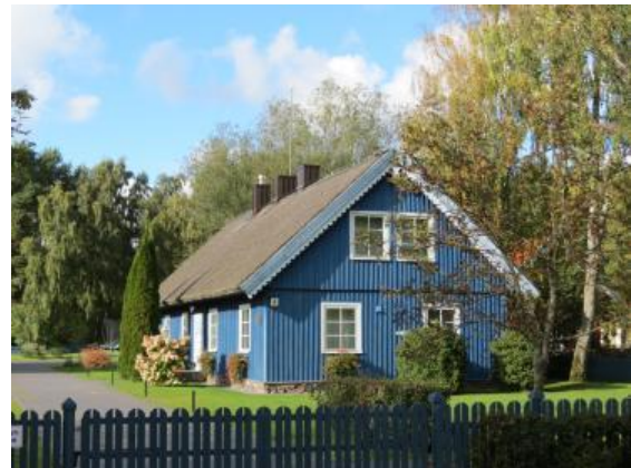
Figure 3.10. Renovated heritage dwelling in Kuršių nerija.

It should be noted though, that not many original dwellings survived and some of the remaining underwent certain changes because the fishermen's dwelling became an object of scholarly interest rather late, and thus one should be careful when estimating their shape and construction. Most of the buildings now included in the register of Lithuanian cultural heritage were built after 1918 (there are about 70 remaining houses). The rest – 27 houses in this region underwent multiple refurbishments in the second half of the 20th century: parts of wooden structures as well as roofing were replaced; interior structures were reshaped and skylighting introduced according to the needs of local tourism. Because of the maritime climate, the dwellings continue to be regularly repainted and their decorative details replaced. Despite attempts to maintain their original look, today many of the vernacular dwellings of Kuršių nerija have lost some of their authenticity. Moreover, it should be mentioned that throughout the last century many traditional building skills were lost because traditional/vernacular buildings were transformed into objects of cultural heritage rather than living architecture.