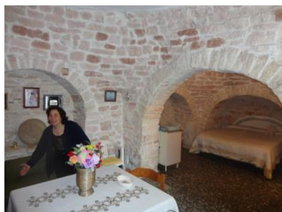
Figure 3.6. Traditional vernacular dwelling, Lithuania.