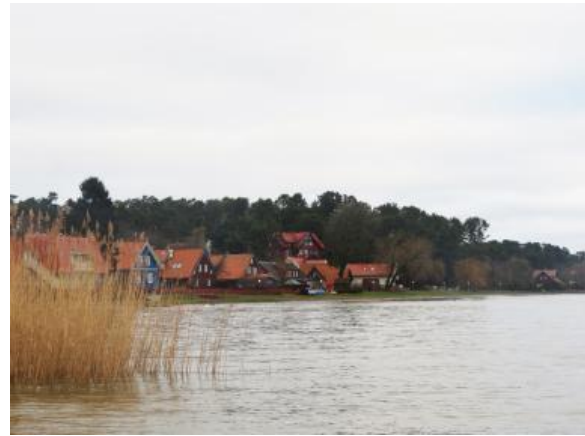
Figure 3.12. Landscape of Kuršių nerija.