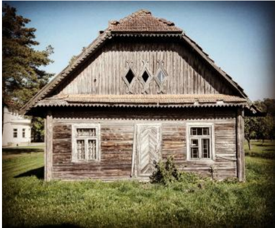
Figure 3.1. Traditional vernacular dwelling, Lithuania. (Photo by A. Gabrėnas, 2015)

Krier, an outspoken critic of architectural Modernism, has argued on many occasions that the main problem is not architectural Modernism as such, but its hegemony and dominance on the global scale since the second half of the 20th century. He insisted that the biggest damage done by architectural modernism was done when this supposedly novel style started to exercise hegemony over all other ways of building. And yet, according to Krier, the most important question is “no longer who will win the war, but of how to increase quality on all sides by establishing intelligent, democratic competition, a pluralist education, and nonpartisan, effective criticism.” (Krier, 2009: 87).