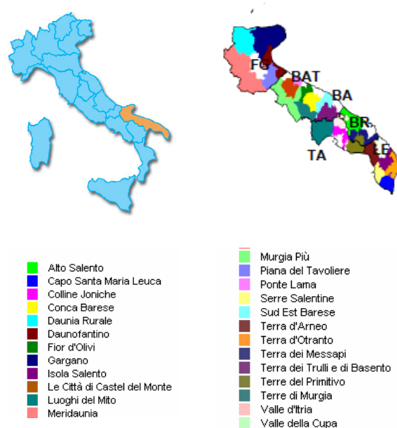
Fig. 2. LAGs covering the Puglia Region

exploratory data analysis, for the purpose of fitting logistic regression models.