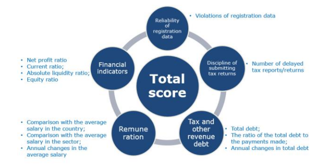
Figure 1. The taxpayer rating system in Latvia (SRS, 2019b)