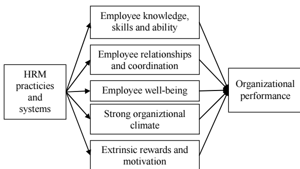
Fig. 1. Some alternative employee-related pathways linking HRM and organizational performance (source: Guest et al. 2012)

David Guest, Jaap Paauwe and Patrick Wright (Guest et al. 2012) in the last new work “HRM and Performance – Achievements and Challenges” have stated that there are many contextual and contingency factors that may shape the HR process at the local level and described some alternative employee-related pathways linking HRM and organizational performance (Fig. 1).