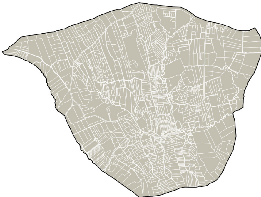
Fig. 1. The system of borders of the registry plots in the village Marcówka

There are 1621 registry plots within the village, whereof 1069 are plots designed for agricultural production. Figure 1 shows the existing system of the parcels borders in the studied village.