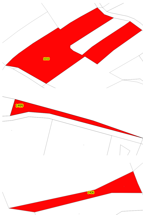
Fig. 3. Examples of shapeless plots