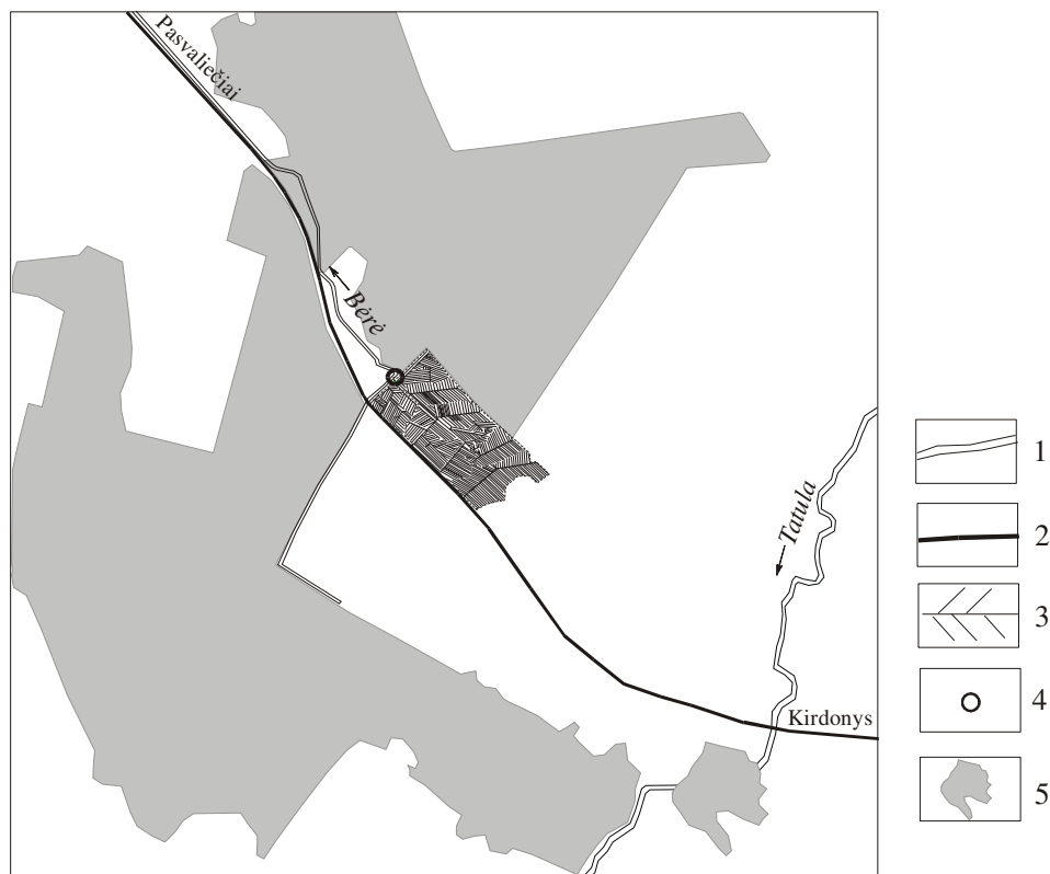
Fig 1. Scheme of investigated area: 1 – river and stream; 2 – road; 3 – drainage system; 4 – place of measurements; 5 – forest

The Student's and Mann-Kendall test and variation coefficient was applied for the research data analysis.